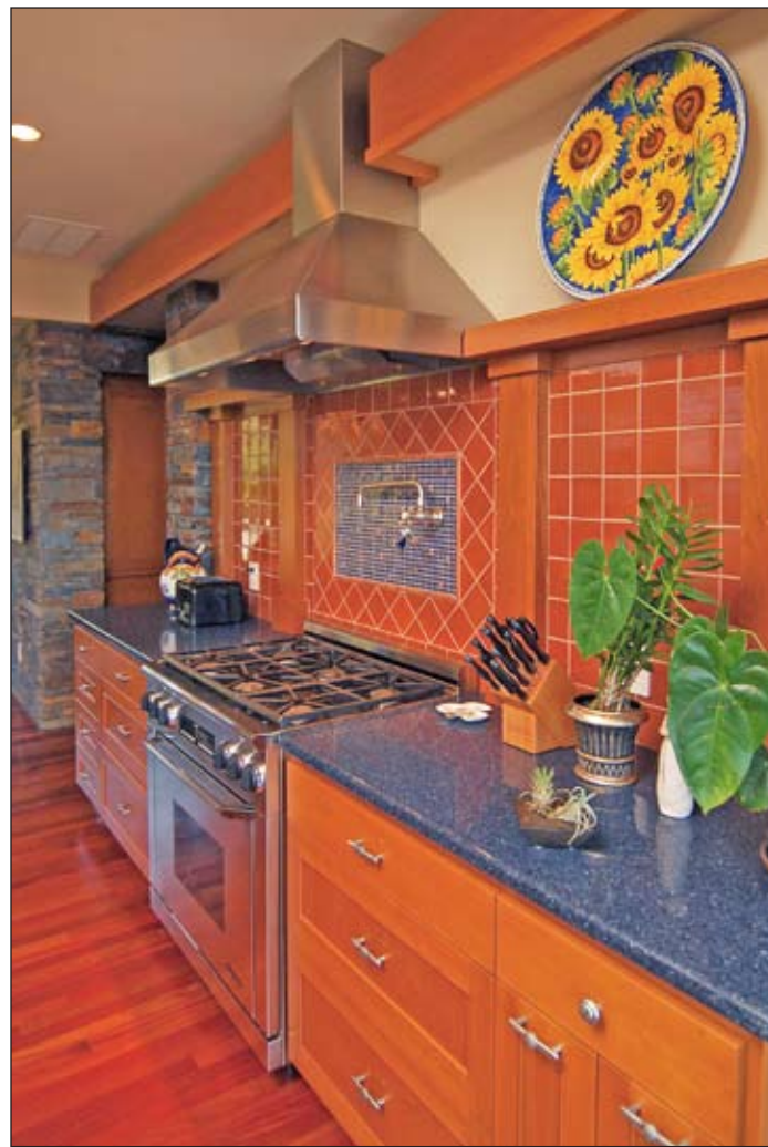
The kitchen boasts festive colors and stainless steel appliances. The home also has a mini-kitchen downstairs for guests and easy entertaining on the patio.